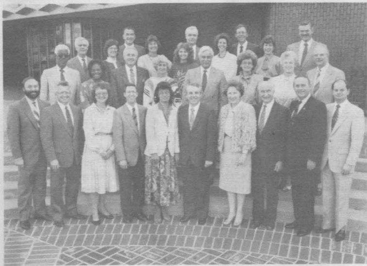
CONFERENCE—Twelve regional directors, their wives and headquarters personnel pause on the Pasadena Ambassador College campus Nov. 15.